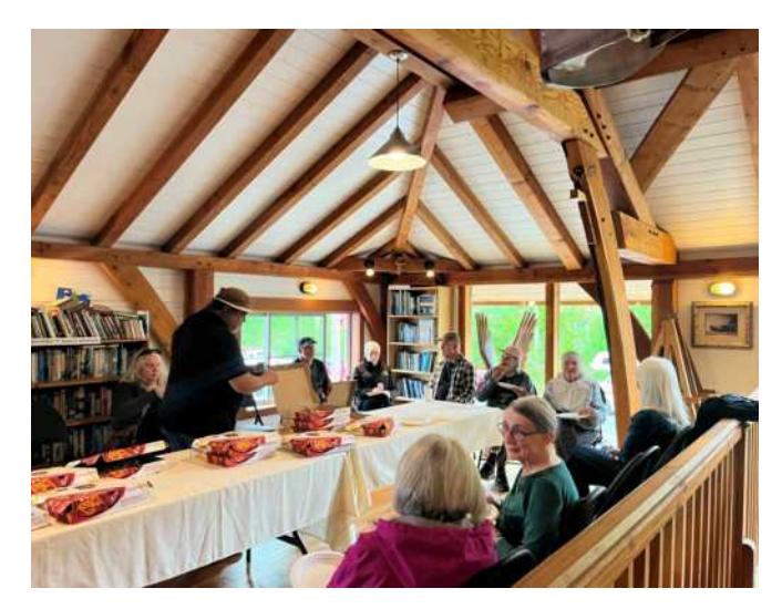
Volunteer Appreciation Lunch