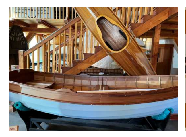
1st - Traditional Lapstrake Dinghy

*Draw: 11:00 am on Friday, November 10, 2023 at the Cowichan Bay Maritime Centre, 1761 Cowichan Bay Road., Cowichan Bay, BC 250.746.4955