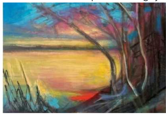
3rd - "Evening Glow" by DominiqueEustace