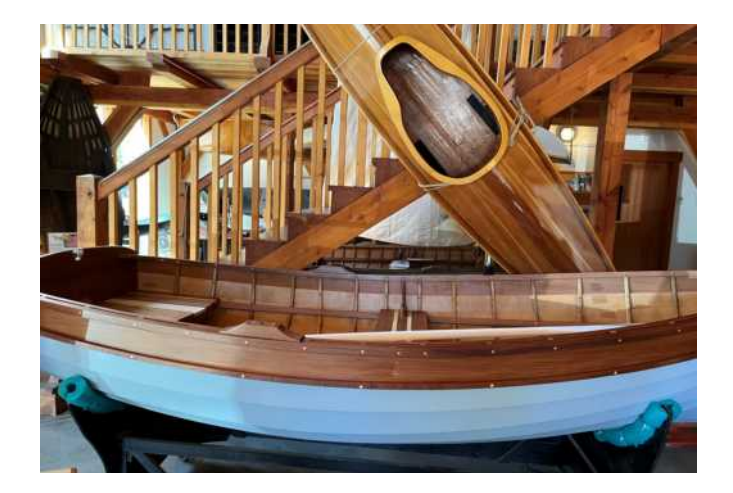
Annual Raffle Boat