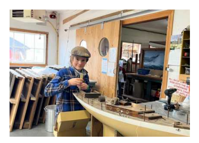
Hunter Boat Refurbishing