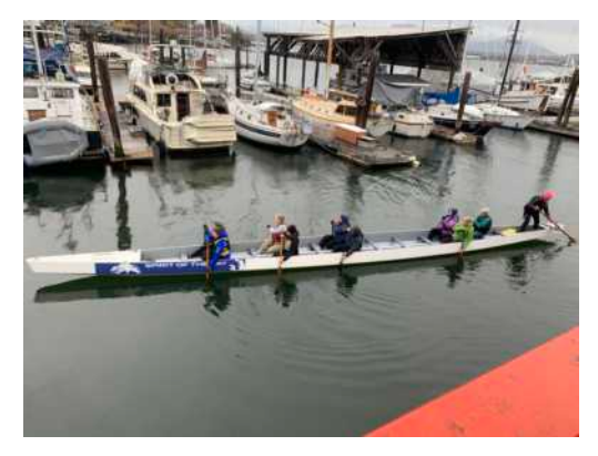
Dragon Boat Season is here