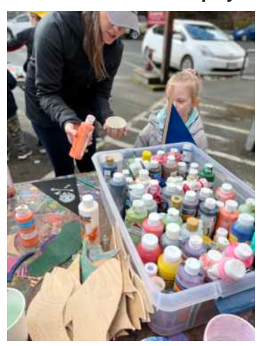
Family Day huge success