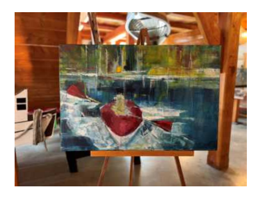
1st Prize 2nd Prize 3rd Prize