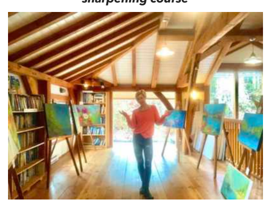
Dominique Eustace art on display