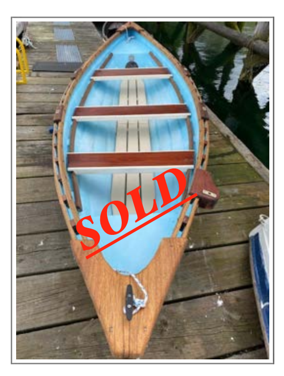
14FT Peapod. Very pretty boat and all ready to go. Comes complete with oars.