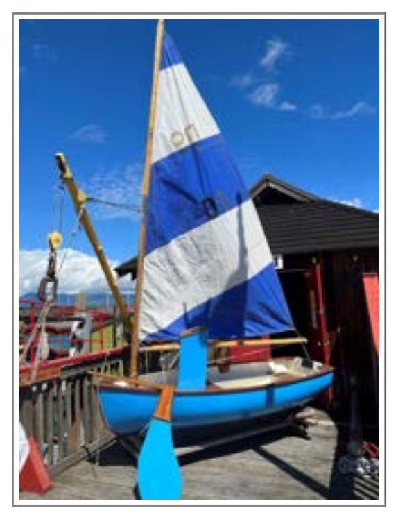
Davidson sailing dingy in perfect condition. At 9FT it would be an excellent boat to learn to sail.